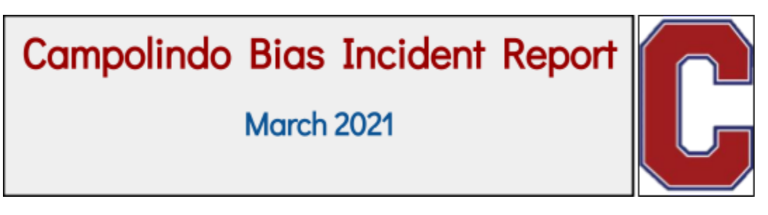
Campolindo strives to inspire and empower every student by fostering belonging, well-being and accountability in an equitable learning environment.